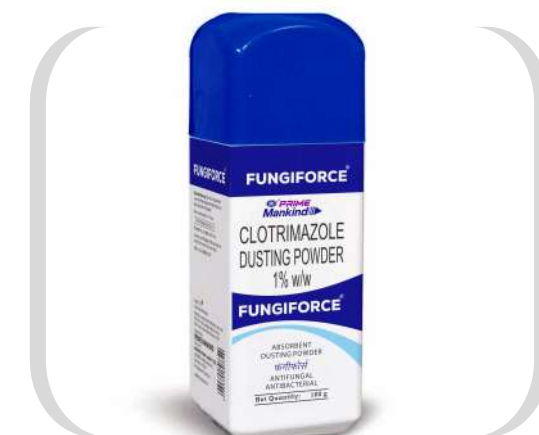
Fungiforce Dusting Powder