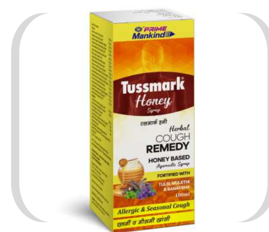
Tussmark Honey Syrup