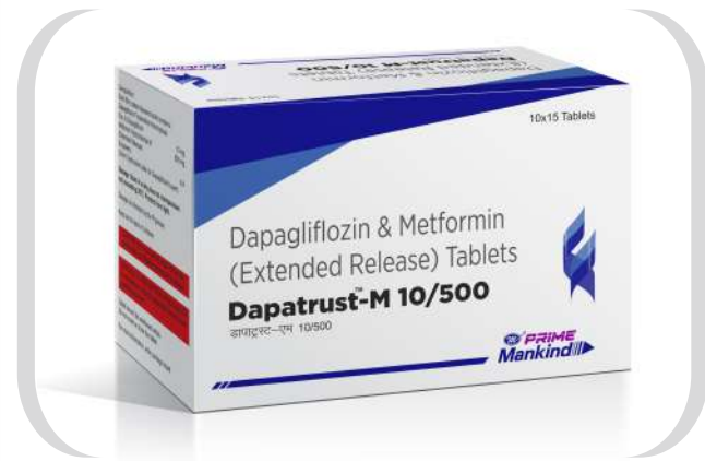
Dapatrust-M 10/500 Tabs.