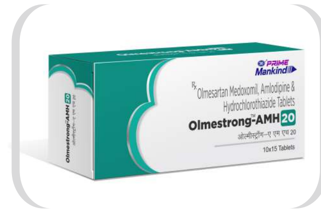
Olmestrong-AMH 20 Tabs.