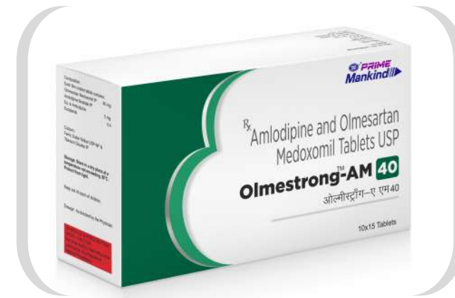
Olmestrong-AM 40 Tabs.