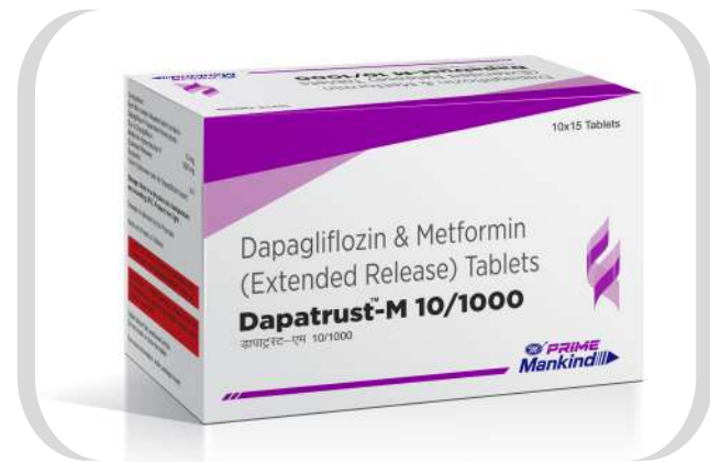
Dapatrust-M 10/1000 Tabs.