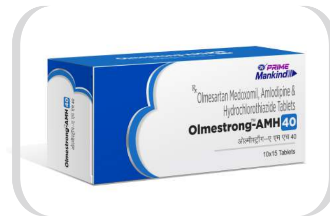
Olmestrong-AMH 40 Tabs.