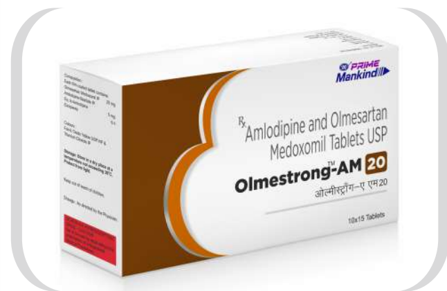
Olmestrong-AM 20 Tabs.